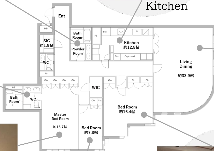
Living & Dining