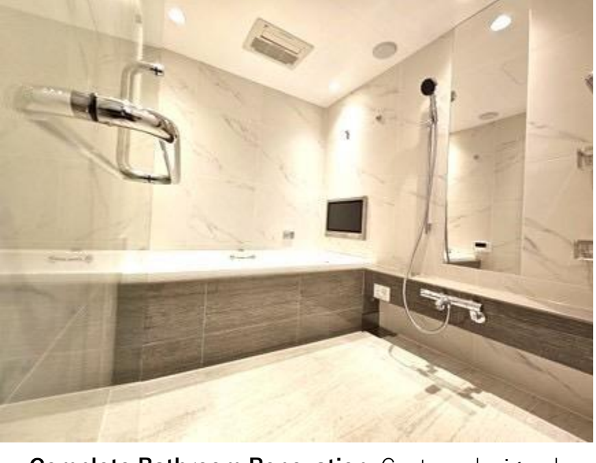
Complete Bathroom Renovation: Custom-designed