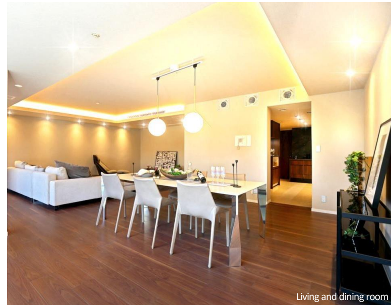
Living and dining room